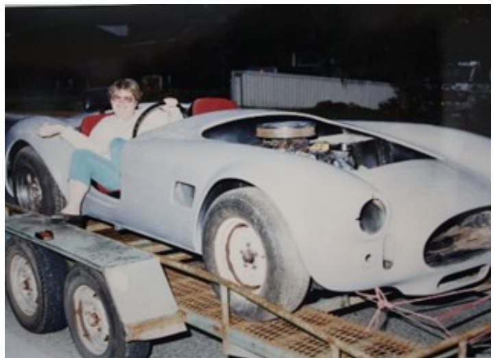
Basic chassis and body home for the first time. October 1995

Way back in about 1995 I bought an unfinished Cobra project that someone had started in the early 1990's, that had been built on a Toyota Crown base, but as happens a lot with these build ups, they had subsequently lost interest. Unfortunately this turned out to be a bit of a disaster on my part, because when I removed the body, to see what I had, and fix up anything I was not happy with, I found the chassis was a hotch-potch of bad 'chicken-dung' welding and nothing was square.