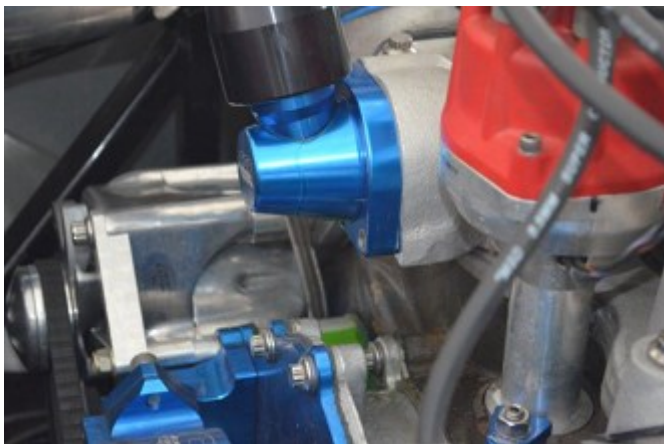
Nice Engine John (a strong 427)