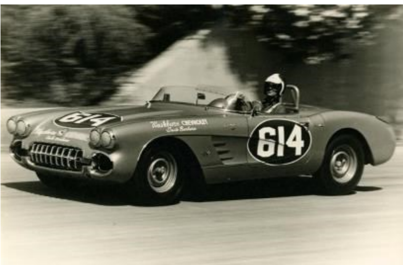
Under the bridge at Pomona in his 1958 Chevrolet Corvette #614.