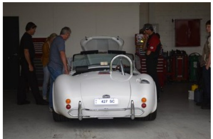
Waiting for things to cool down