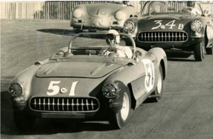
Bondurant won 18 of 20 races in his #51 1957 Corvette during the 1959 racing season.