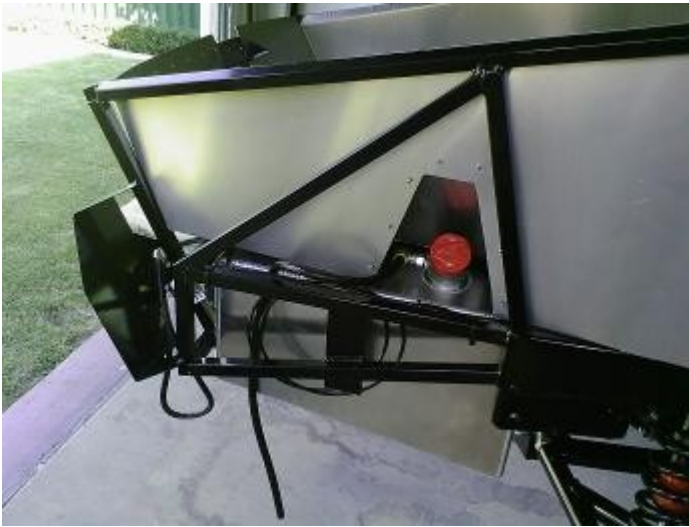
Tank installation completed

It is worth noting that most cars are fitted with fuel injection systems. Always make sure that fuel in the tank is not given the chance to surge or allow the fuel pump to run dry. It will destroy the pump. Also, ensure you fit flexible hoses that are rated for high pressure and for unleaded fuels. I prefer to run a catch tank at the base of the main tank. Some installations will have a remote mounted surge tank fed from the main tank with a low pressure pump feeding the surge tank or the HP pump mounted inside the fuel tank.