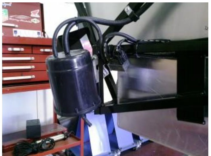
Evaporative emissions canister and control valve