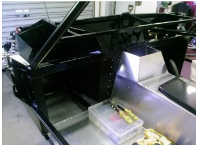
Passengers floor pan glued and riveted in place