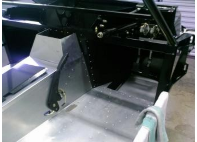
Drivers floor pan, tunnel sides and engine bay panels installed. Steering column and pedals also fitted.

Now that the basic suspension is hung, some of the panelling can be installed. The panels are firstly degreased then glued in place with Sikaflex and secured with rivets. It is important to remember not to box yourself into a corner while fitting the panels. Once the main seating area and engine bay panels were installed, the pedals and steering column were installed.