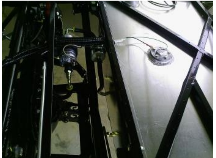
Steel fuel supply and return lines installed, fuel pump installed