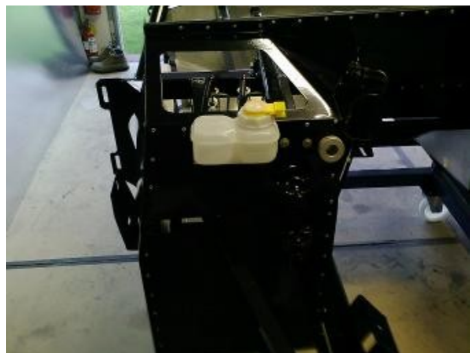
Dual chamber brake reservoir fitted (includes integrated brake fail switch for ADR compliance)