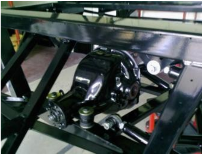
Ford 8.8" differential fitted (with Detroit Locker LSD)