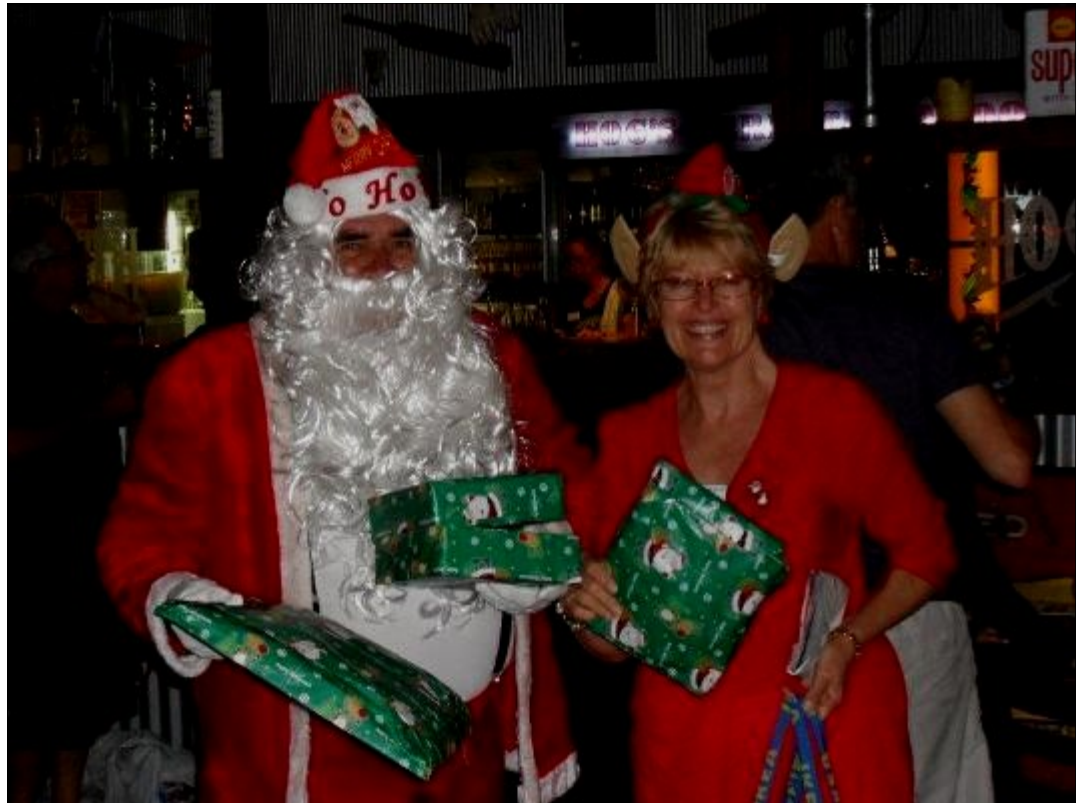
Santa and his helper, prior to handing out a special gift for all those who attended.