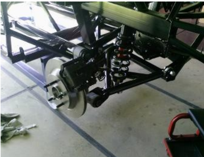
Rear suspension and brakes

Now that the basic suspension is hung, some of the panelling can be installed. The panels are firstly degreased then glued in place with Sikaflex and secured with rivets. It is important to remember not to box yourself into a corner while fitting the panels. Once the main seating area and engine bay panels were installed, the pedals and steering column were installed.