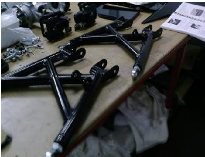
Fabricated rear control arms (Note : two left hand arms were incorrectly provided)