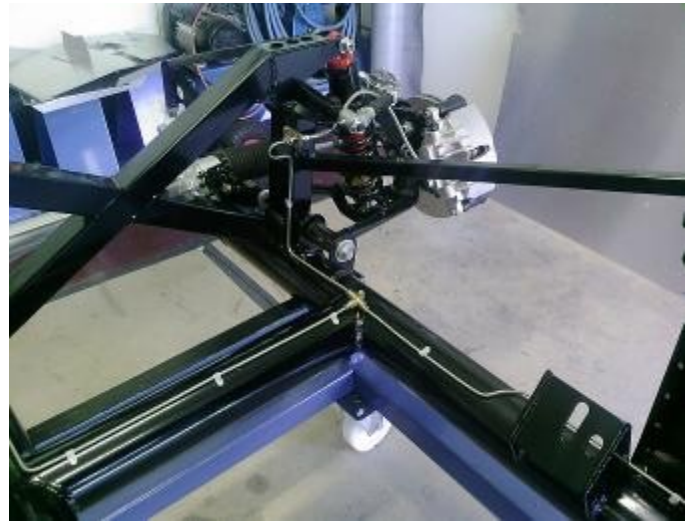
Front driver side brake pipe installation

Hard plumbing lines for the fuel and brake systems can now be run through the car. The routing for these lines was planned out for the best and most practical locations. The lines were then measured, bent and installed. Nylon P clips were used at appropriate locations to secure the lines in place. These are readily available in various sizes from electrical wholesalers. It is important to note that if using braided flexible brake lines that these carry DOT certification marks. You are not allowed to, nor is it safe to make your own braided brake lines.