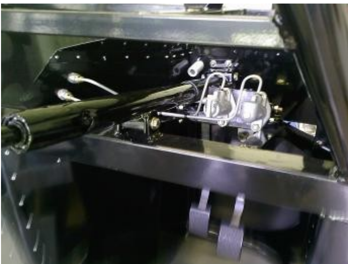
Brake master cylinders plumbed. (5/8" front and rear)