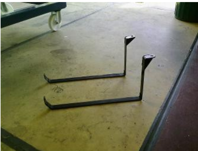
Fuel tank and fabricated support straps with rubber isolator strips to prevent chafe on chassis.