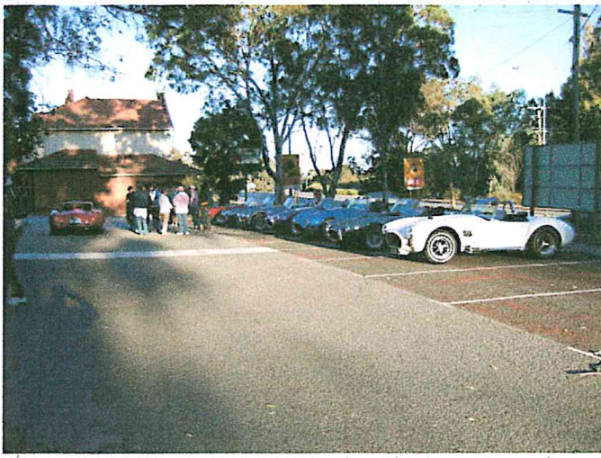
Meeting at Ye Olde Narrogin Hotel Armadale