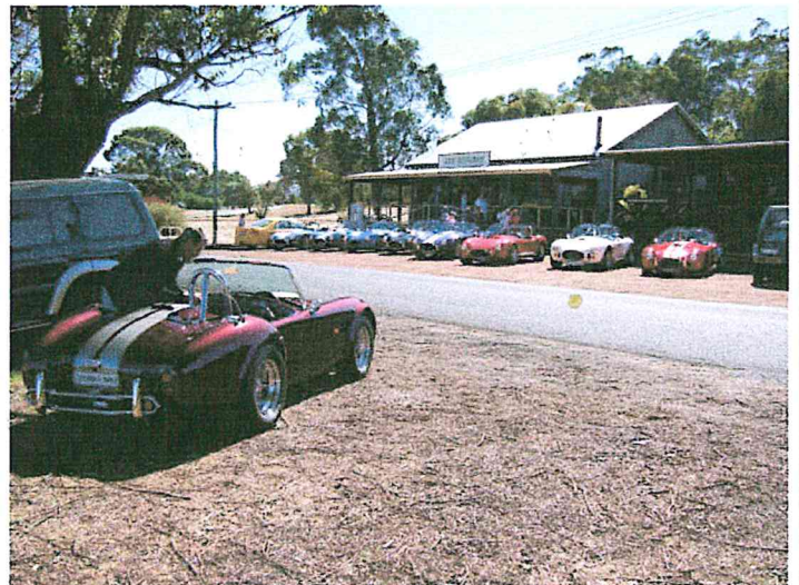
Out side the Yarloop Cabin Restaurant