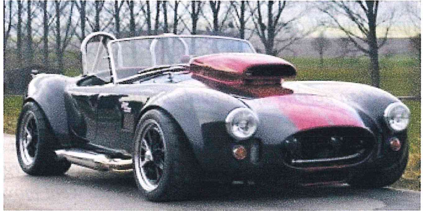
Weineck Cobra 780CUI Limited Edition