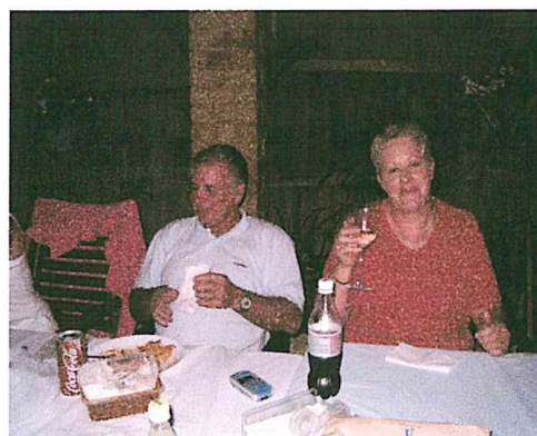
Nola wondering whether she should cool him down with a nice white